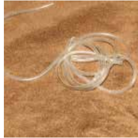
6 Feet of 1/4 inch