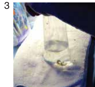
Fill the rest of the bag with air and tie the bag off with a rubber band.