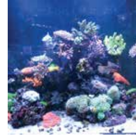
A saltwater aquarium.