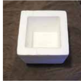
A medium-sized 1 gallon food-grade plastic container.