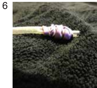
Twist both of the rubber bands around the air tube until it is completely wrapped around.