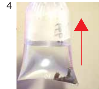
While taking the coral back to your tank, make sure to keep the bag upright.