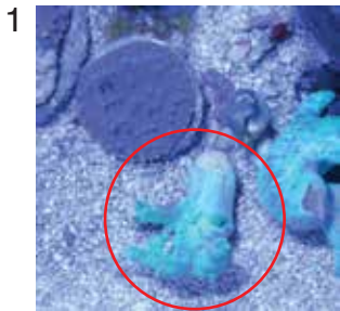
Pick out a coral that you want.