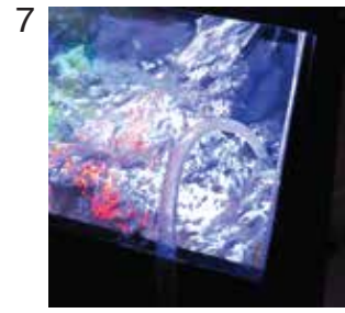
Place the end of the tube without the rubber bands into your aquarium.