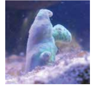
A piece of coral.