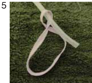
Place one end of the air tubing through one of the rubber bands.