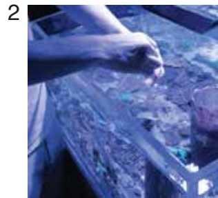
Fill the bag 1/2 way with water from the aquarium that the coral was in.